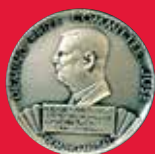
DEMING PRIZE 2003