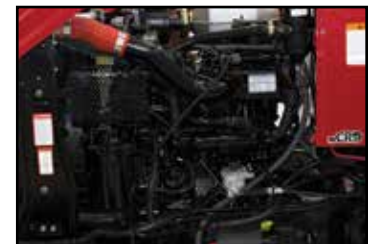
Engine - left side view